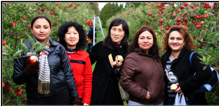
September 2009, LINC participants picking apples at Thiessen Orchards