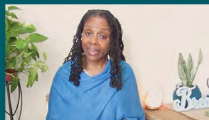
Mindful Breathing: Progressive Muscle Relaxation