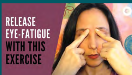
7 Exercises to Relieve Eye Strain

daily lessons, which has been proven to increase their confidence with daily interactions and improve English skills. This program is funded by Immigration Refugees and Citizenship Canada.